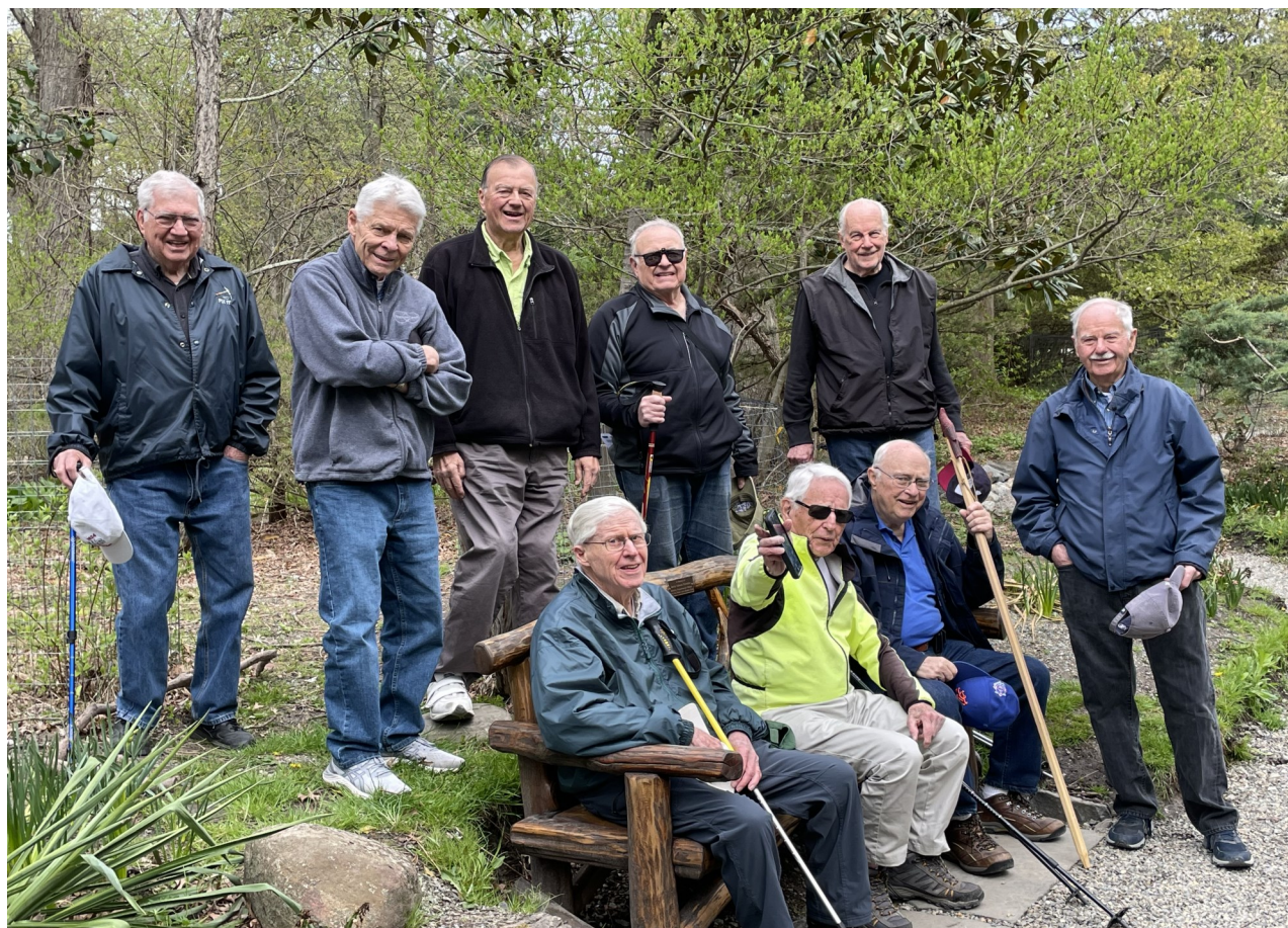
Campgaw Ski Area